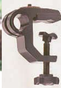
TC Table Clamp