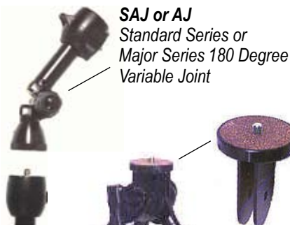
SAJ or AJ Standard Series or Major Series 180 Degree Variable Joint