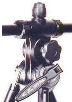
SCCTB or MACCTB Standard Series or Major Series Center Column Tilt Bracket