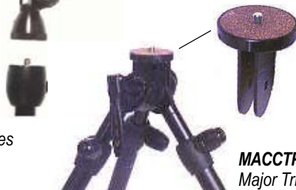
MACCTP Major Tripod Center Column Tilt Platform