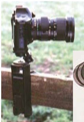
UC Universal Clamp