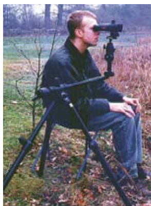
Major System Tripod

This is our heavy-duty tripod designed for use by professional photographers and videographers. They are strong and provide essential stability when using heavy equipment and large lenses. UNI-LOC tripods perform in all weather and rugged ground conditions. 'Major Series' tripods have two section legs. Series 30 or 60 Ball Heads or Series 35 Pan Heads are best suited for use with these tripods.