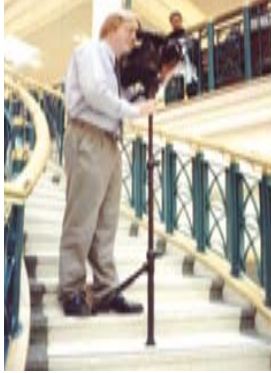
Bracket added to Monopod becomes a Duopod

There are two sizes available, the DPA for Standard Series monopods (lighter weight equipment) and the DPK for UNI-LOC Major Series monopods (professional use and heavier equipment). Specifications shown after description are the suitable leg diameter and weight .