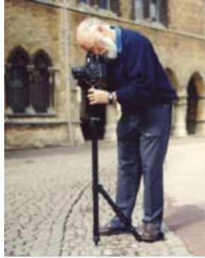
Monopod shown with Duopod bracket